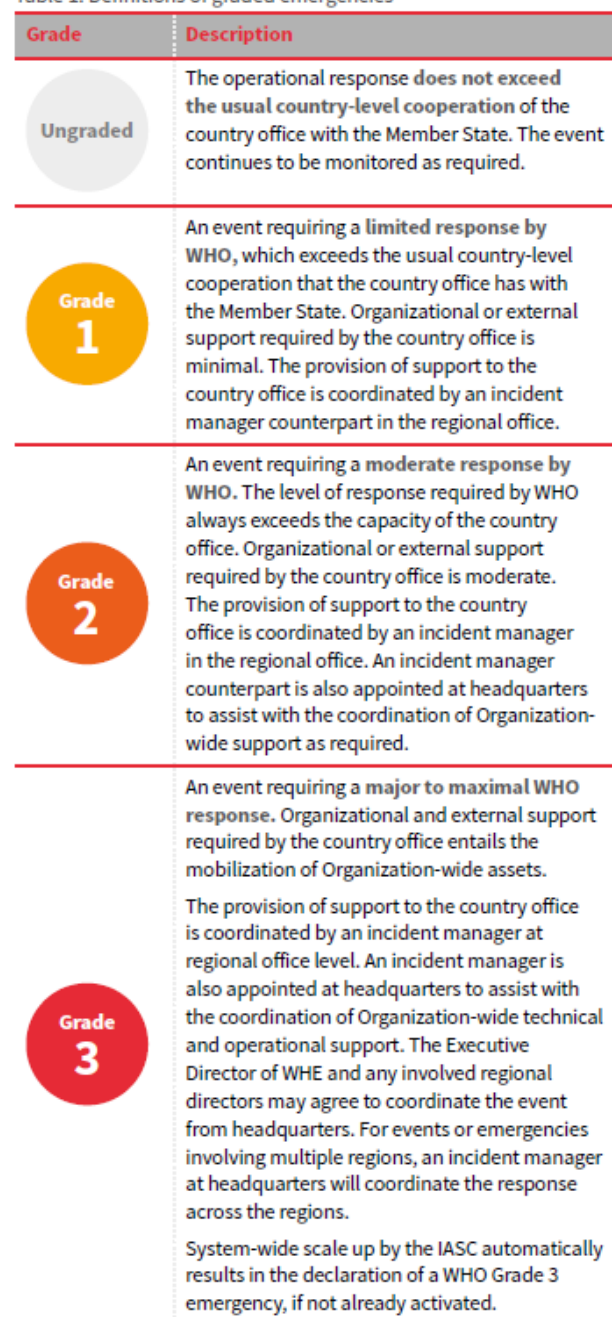
Table 1. Definitions of graded emergencies